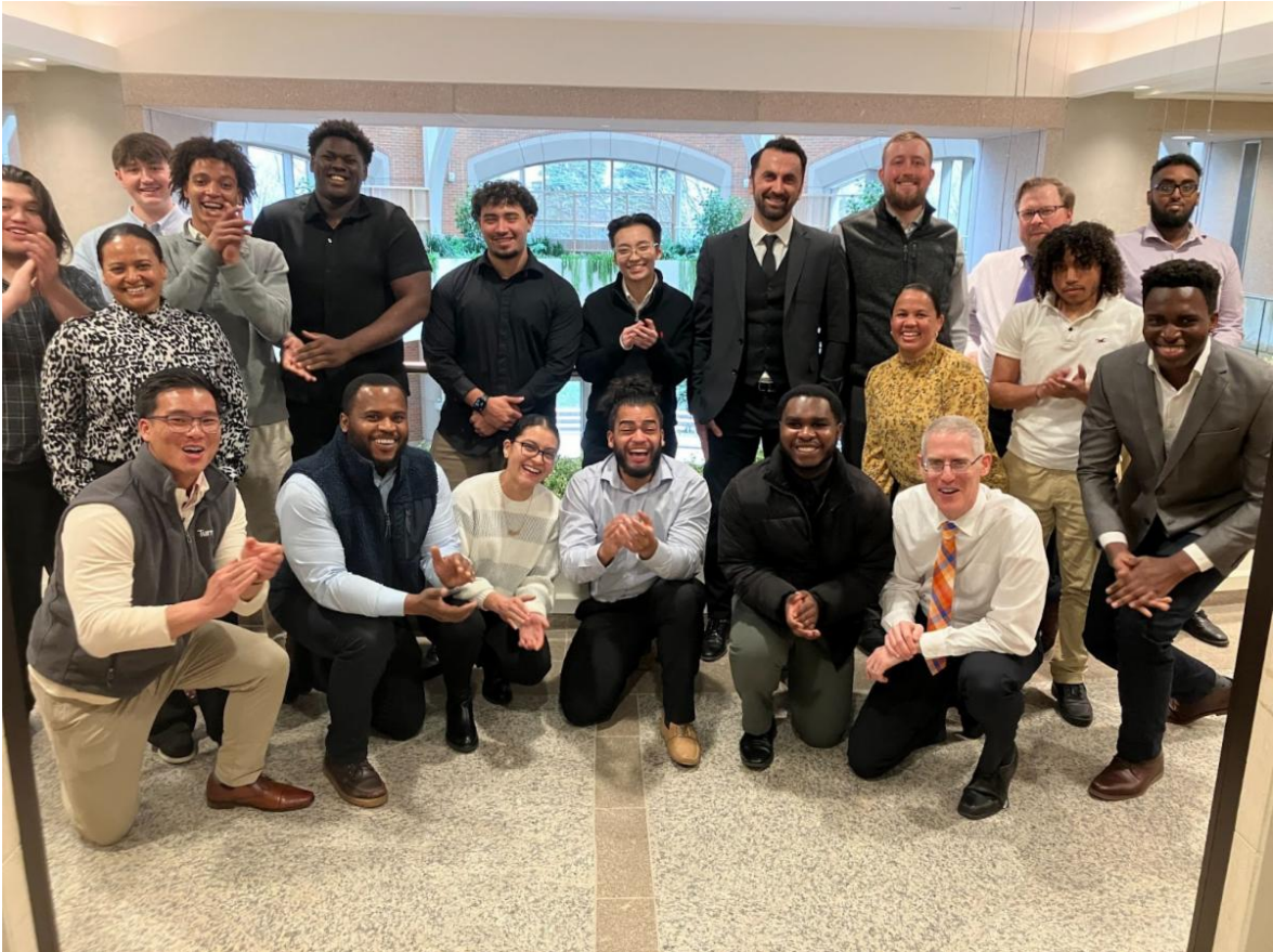
This month, 25 Franklin Cummings Tech automotive and construction management